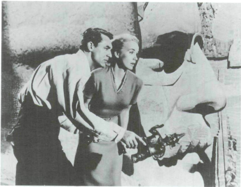
In a ruse that angered government officials, Hitchcock directed the filming of the movie's climactic scenes against a studio mock-up to give the illusion that Grant and Saint were actually on the monument.

Altogether, the crew lensed three scenes at Mount Rushmore: Eva Marie Saint's staged shooting of Grant in the memorial's cafeteria, the parking lot scene in which rangers haul away Grant's "dead" body in a station wagon, and a number of views of the memorial from various terraces. Ironically, the way in which some of these general views and the still shots of the stone faces were used contributed to much of the subsequent controversy surrounding the film. Technically, Hitchcock would keep half of his word to the National Park Service. While he did not film any chase scenes on the real memorial, he eventually shot them on a studio mock-up or against a background composed of the still shots. At the close of the on-site filming in September 1958, the Rapid City Daily Journal innocently reported, "A replica of the national memorial will be reproduced full scale at Culver City for additional closeup scenes." 16