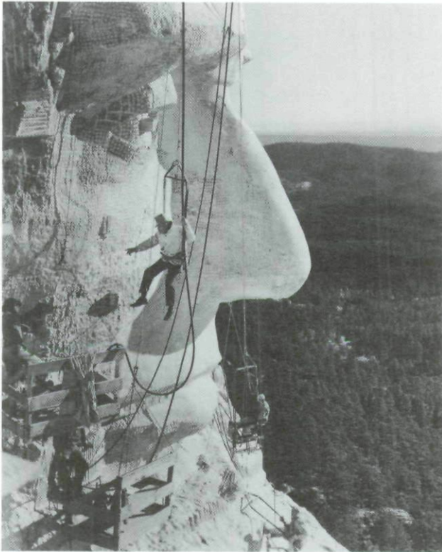
Sculptor Gutzon Borglum, shown here at work on the likeness of President Lincoln in the late 1930s, might have enjoyed the publicity Hitchcock's film brought the memorial.

available to me and it is possible that at some other time I will prepare a speech and put it into the Record for you." 31