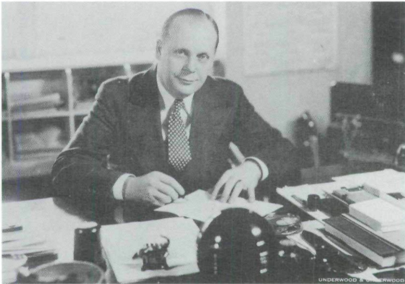
Pictured here at the time he opposed the distribution of The Plow That Broke the Plains, Sen. Karl Mundt vowed to take dramatic action after Park Service officials alerted him to the "deliberate desecration" of Mount Rushmore in the Hitchcock film.

Wirth responded to Mundt on 20 August with a four-page letter and more extracts of letters, reviews, and news stories about North by Northwest . The Park Service director recommended that if Mundt decided to speak in the Senate about the Park Service's problems with the movie, he "should make a very firm statement to the effect that the desecration was the result of a studio mockup" and not the use of the actual memorial. Wirth ended his letter with an important bit of information. "I have been informed by a local