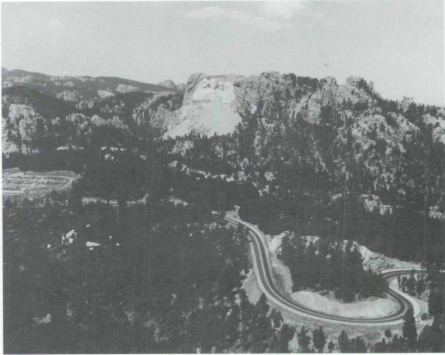
Mount Rushmore, its visitors' facilities, and the surrounding woods serve as the backdrop for the climax of Alfred Hitchcock's complicated thriller North by Northwest.

official and be accused of committing the crime. The film chronicles his cross-country flight from both the police and the communist agents (James Mason, Martin Landau, and others), which takes him from New York to Chicago to Indiana and, finally, to South Dakota. Along the way, Thornhill falls in love with the icy blonde CIA spy, Eve Kendall (Eva Marie Saint). The drama culminates at Mount Rushmore, with Kendall and Thornhill scrambling about the presidential faces to elude the enemy agents. 7